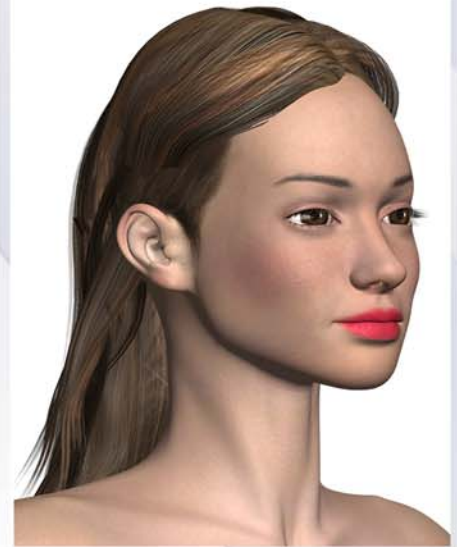
45 Degree One Left | One Right