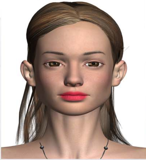
Face Forward Level with Camera

Do Not Take Photos Yourself Surgeon will not accept selfie photos as they distort the required image