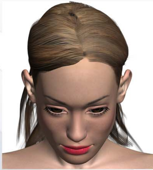
Forward Face Down Level with Camera