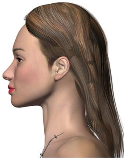
Left Profile Level with Camera