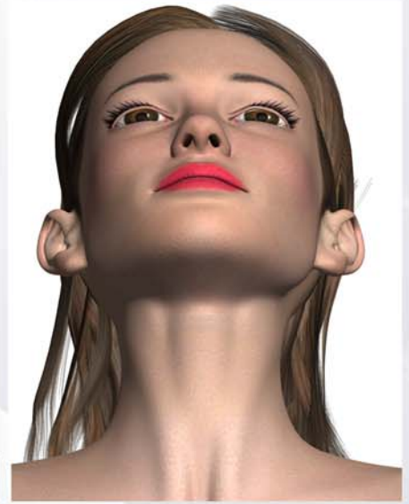
Forward Looking Up Level with Camera